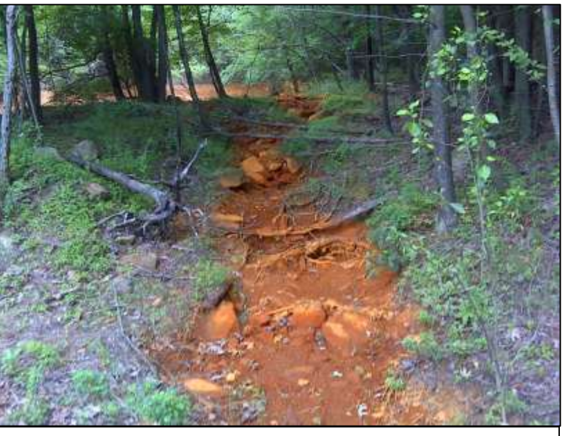
Photo 4. View of the overflow channel from the southern abandoned stripping pit.

Solution: Overflow from these stripping pits could be diverted into a limestone channel to increase aeration and then into a passive AMD treatment system in an effort to neutralize the water and remove harmful metals