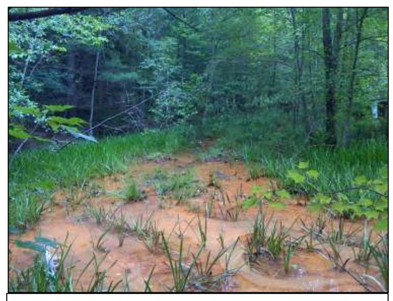
Photo 3. View of an existing wetland located within the AMD discharge behind the Moss Glen Rod and Gun Club.

AMD discharge behind Moss Glen Rod and Gun Club: Water in this stream section was extremely