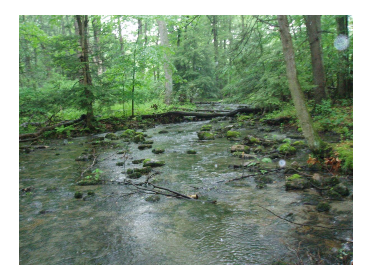
Figure 4. Benthic macroinvertebrate Station 2 on Greenwalk Creek below the trout hatchery sampled on May 20, 2008.