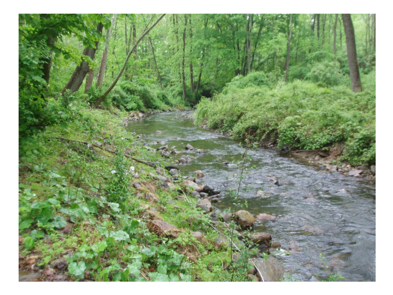
Figure 5. Benthic macroinvertebrate Station 3 on Jacoby Creek sampled on May 20, 2008.