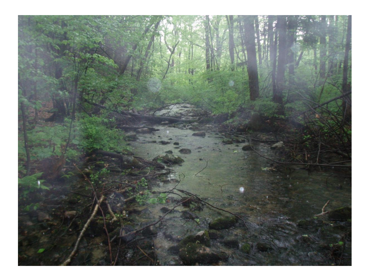
Figure 3. Benthic macroinvertebrate Station 1 on Greenwalk Creek above the trout hatchery sampled on May 20, 2008.