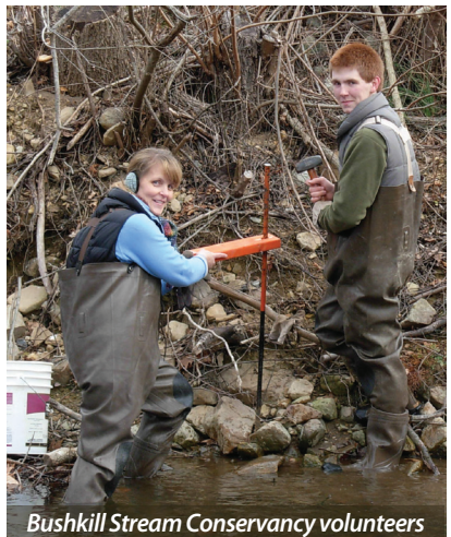
Bushkill Stream Conservancy volunteers prepare to plant shrubs along Sober's Run

Riparian buffers have been lost in many places in the Bushkill Creek Watershed over the years. Preserving existing buffers and restoring lost ones are important steps forward for water quality, stream bank stability, flood protection, and fish and wildlife habitat. Landowners, farmers, governments, businesses and conservation organizations can all work together to help restore and protect riparian buffers, which in turn restore and protect the quality of our streams and drinking water.