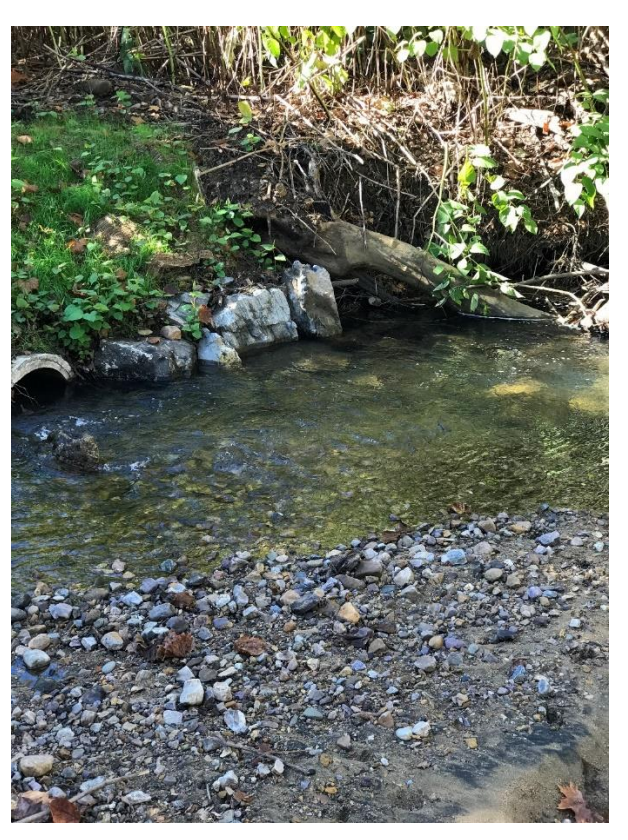
Image 1: Looking across the stream where the dam was located, right to left