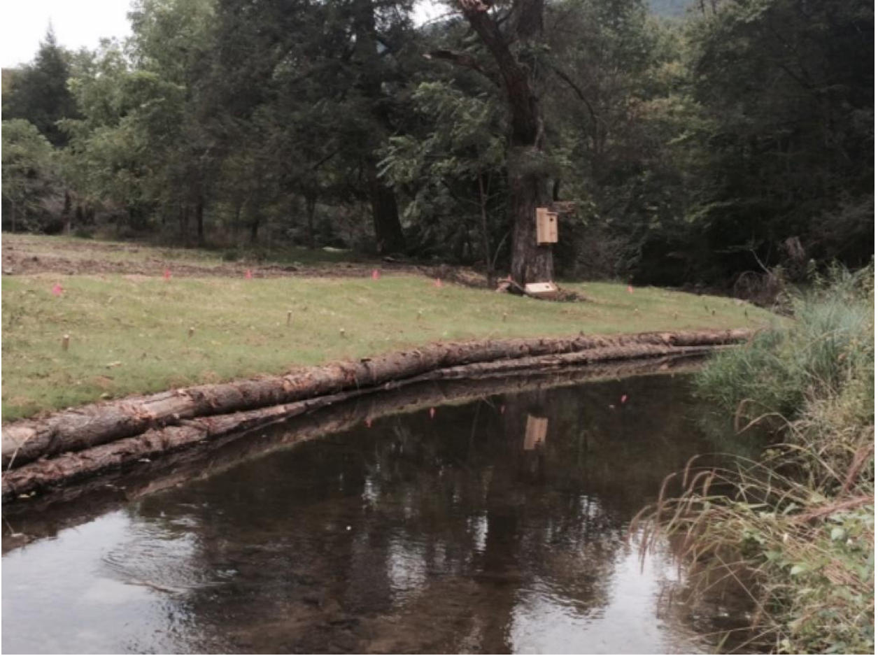
Completed mudsill (after)