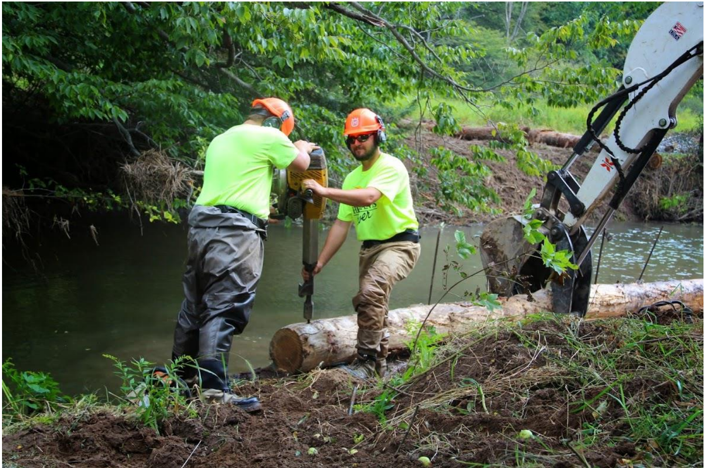
In-stream construction of mudsill overhead cover structure