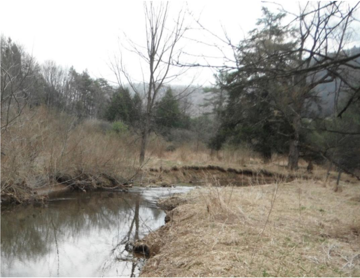
Typical bank erosion at Myers Farm fallow pasture (before)