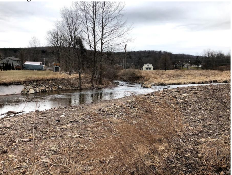
February 25, 2020

Additional photos can be provided. These two "match up" the best since the "big" trees and buildings can be seen.