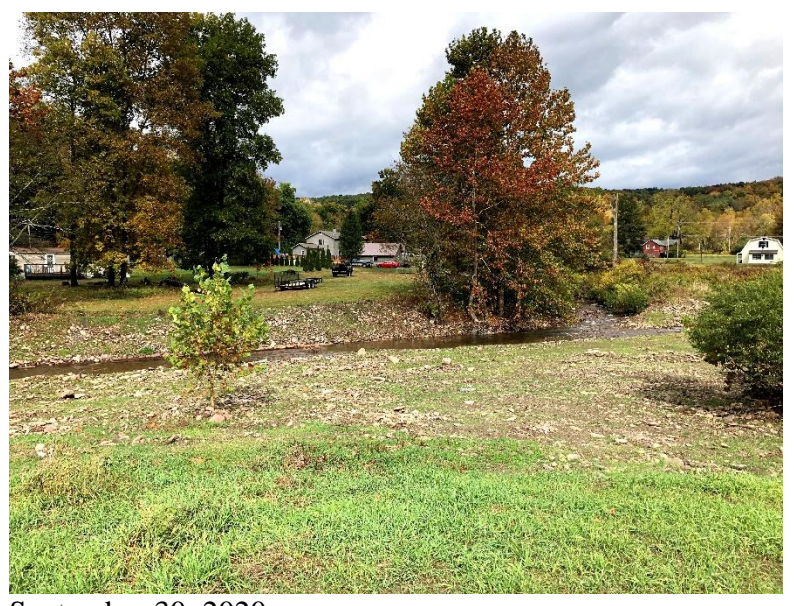
September 30, 2020

The last 2 pages of the report have 2 other sets of before and after. They don't match up as well, but are close.